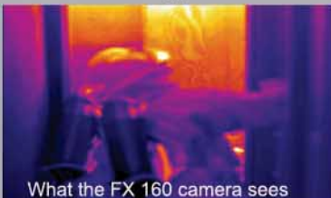
What the FX 160 camera sees

Since it is a technology designed to sense and display heat signatures, the camera provides "sight" in dark and smoke filled environments, which is invaluable in the decision making process. Infrared thermal imaging systems are being integrated into fire control, management and firefighting services throughout the world. Infrared Cameras, Inc. offers solutions that meet and exceed the operational needs of these applications.